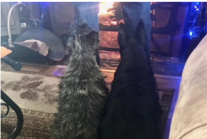
The Tooch Pups