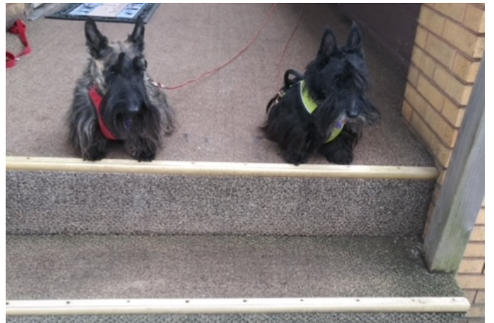
The Tooch Pups Ready to Go