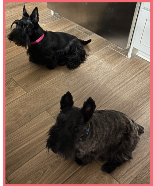
Hopper & Toby